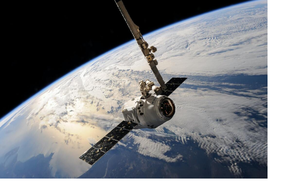
How Rockets, Satellites, and Telescopes Are Enhancing Our World and Helping to Understand the Universe