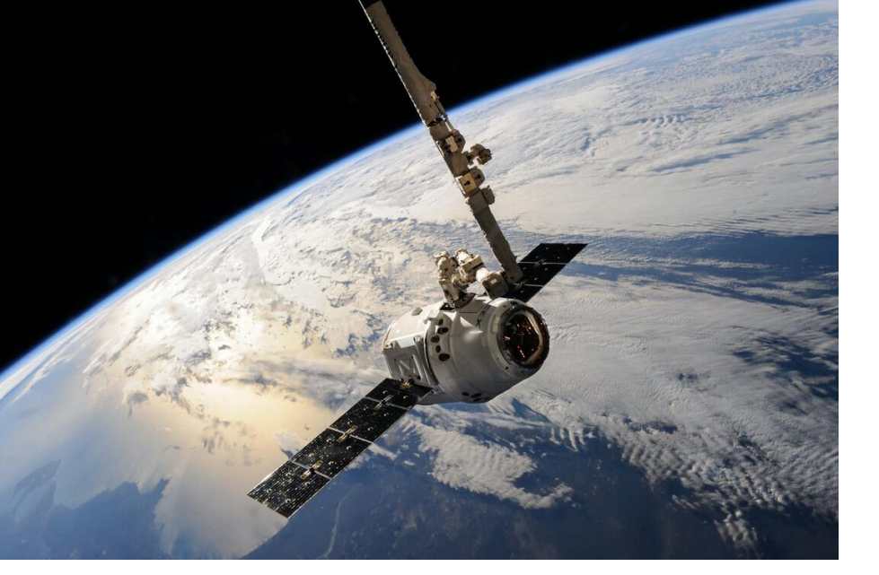
How Rockets, Satellites, and Telescopes Are Enhancing Our World and Helping to Understand the Universe